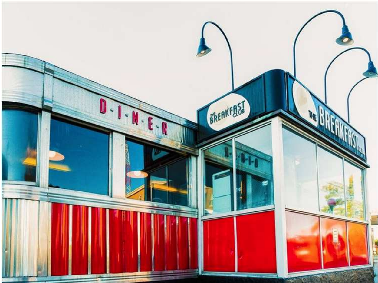
The Breakfast Club